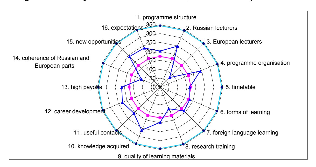
Figure 1: Summary of Student and Graduate Questionnaire Responses

impression of the nature of opinions held. The results for Statements 3, 8 and 14, for instance, include the responses of Year 1 students for whom these questions were still, at the point of responding, still unfamiliar issues – their responses therefore skew the overall score towards the lower end of the scale. In the report below, accordingly, the reader will be encouraged to refer not only to the combined set of results, but also to the results by cohort (included in Appendix 1).